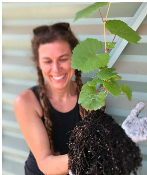
California Grape Sale Plant

email: mail@napavalleycnps.org web: https://chapters.cnps.org/napa/