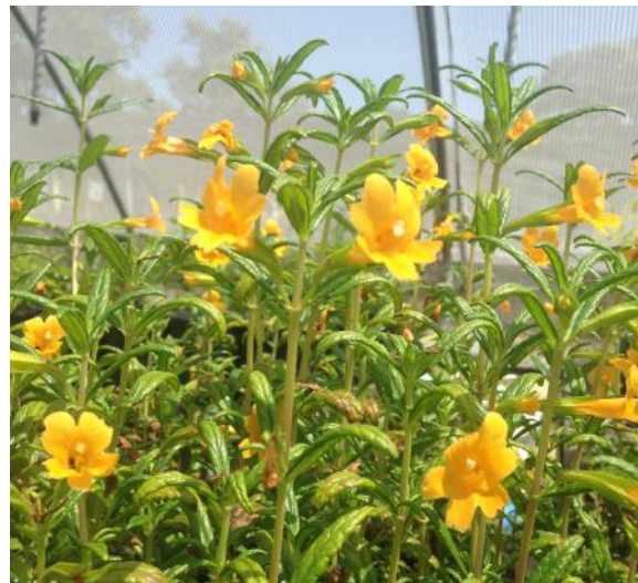
Sticky Monkey Flower