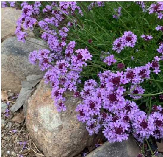
Purple Cedros Island Verbena