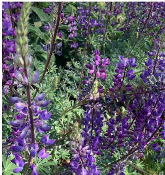
Silver Bush Lupine