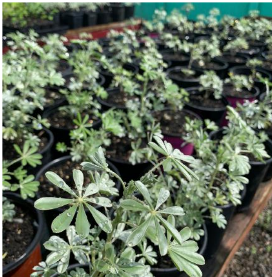
Silver Bush Lupine