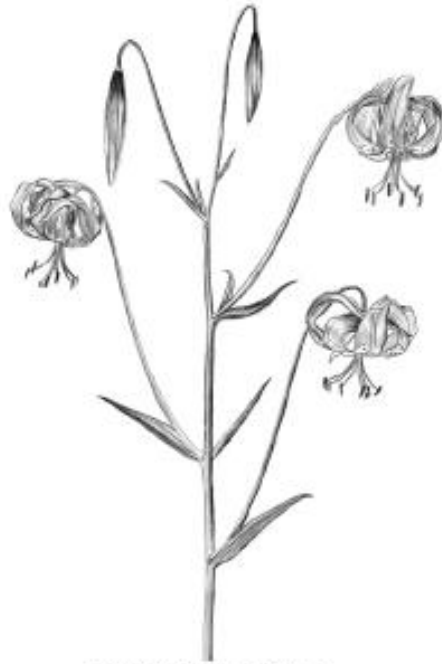
Lilium pardalinum ssp. pitkinense

Saturday October 12, 2019 10:00a.m. - 2:00 p.m. Laguna Foundation 900 Sanford Road (off Occidental Road)