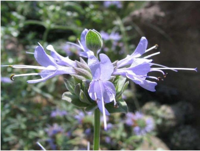
Salvia cleavelandii

We will also have many of the other drought tolerant and popular shrub species – Ceanothus /CA wild lilac. Large numbers of C. 'Concha' (to 8') and C. griseus horizontalis a ground cover (2'x6') are available and limited numbers of C. 'Centennial' (1'x4'), C. gloriosus 'Anchor Bay' (2'x6'), C. 'Dark Star' (6'x6'), C. maritimus 'Valley Violet' (4'x6'), C. thyrsiflorus (12'x12'), and C. thyrsiflorus 'Skylark' (8'x8').