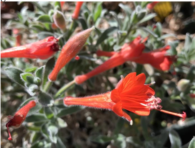
Epilobium canum

The Zauschnerias ( Epilobium canum ) will be well represented with E. 'Liz's Choice' and 'Everett's Choice'. The bright red flowers of Zauschneria are a vital part of the fall garden. The red flowers attract hummingbirds and with a little extra water will bloom until the first frost. We will also have Epilobium septentrionalis 'Select Mattole' that is very low growing with bright red flowers; perhaps best grown in a container.