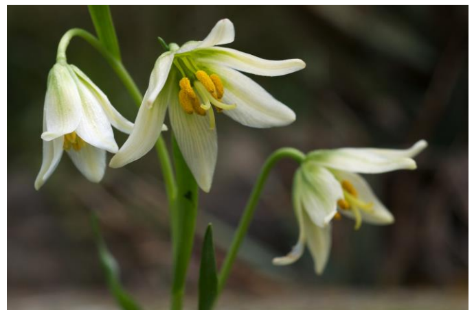
Fritillaria liliacea (fragrant fritillary) https://commons.wikimedia.org/wiki/File:Fritillaria_liliacea_2.jpg

West county carpool: Ruthie leaving 8:30 from Lucky parking lot in Sebastopol.