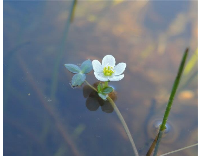
Ranunculus lobbii , CNPS 4.2 Calflora.

Continuing on, we ascended the undulating trail and encountered a small patch of white nemophila/white baby blue eyes ( Nemophila heterophylla ). Soaproot ( Chlorogalum pomeridianum var. p. ) was in its leafy stage and quite abundant everywhere.