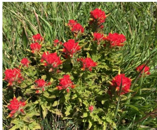
Castilleja wightii, Wendy Smit.

After fording the creek in one's chosen manner, we huffed up the short hill to the coastal bluffs, which did not disappoint, botanically. The most exuberant bloom of Douglas iris ( Iris douglasiana ) I'd seen at this location, fields of the tiny pink version of butter n' eggs ( Triphysaria eriantha ssp. rosea ), scattered pussy-ears, clumps of low-growing checker mallow ( Sidalcea malvaeflora , some fitting the characteristics of CNPS-listed var. purpurea ), the earliest blooms of the multi-colored lupine ( Lupinus variicolor ), big patches of goldfields ( Lasthenia gracilis ), the pink pom-poms of thrift, or sea pink ( Armeria maritima ), and of course, California poppies – the coastal version with petals golden at the base, yellow toward the tips. And others! Another treat was an amazing orange, red, black and white “woolly bear” caterpillar that Darlene determined was the larva of the garden tiger moth ( Arctia caja ).