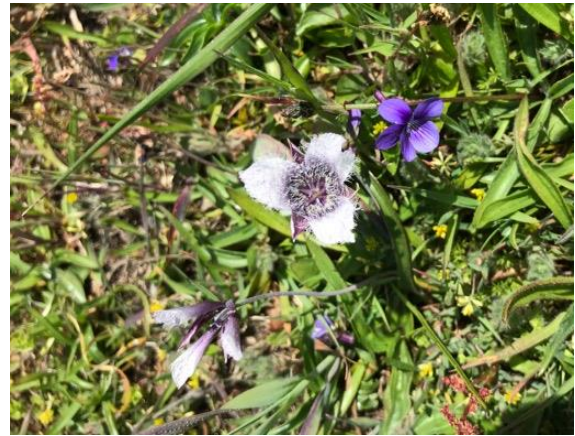
Calochortus tolmiei , Wendy Smit.

Fair skies and a bit of a breeze greeted our 15 hikers as we assembled in the Stump Beach parking lot to hand out plant lists, and give the name of our favorite flower of the day (the winner - Pussy ears, Calochortus tolmiei ). Before venturing out, we noted that the native Bishop pine ( Pinus muricata ) forest that surrounds the parking lot and extends through much of the lowest coastal terrace of Salt Point State Park, is aging, and becoming senescent due to lack of fire. Bishop pine is one of California's "fire pines," which depend on fire to reproduce. The cones remain on the trees and closed, containing live seed, until a fire comes through. Post-fire, the cones open, depositing years of accumulated seed on the now-bare soil, enriched by ash. Without fire these trees eventually die, as is happening within Salt Point SP, creating a dense understory of fallen branches and trunks.