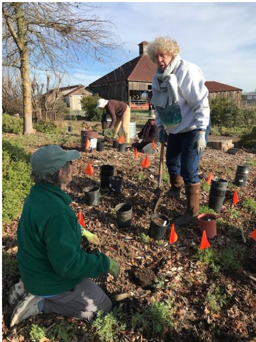
Planting manzanita and milkweed leftover from plant sale on First Fridays.

This past year the Milo Baker chapter has enjoyed our continuing partnership with the Laguna Foundation ( LagunaFoundation.org ). There are many ways both our organizations benefit from working together. Two years ago we were all thrilled to be building a shade house/nursery side by side. We joined with staff to gather local acorns after the fires. Now we have a faithful party of volunteers working on the gardens at the Foundation's Conservation Center, propagating in the nursery and staffing the plant sales and annual garden tour.