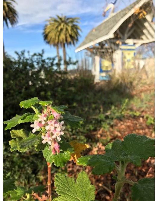
Ribes sanguineum var. glutinosum in the Laguna garden.

We were fortunate to have the CNPS Executive Director presentation at Heron Hall last year and this year on February 22 we will co-host an invasive plant training there with local experts and CAL-IPC. We are especially lucky to have the Laguna staff and volunteers working on the preservation of endangered plant species like Sebastopol meadow foam ( Limnanthes vinculans ).