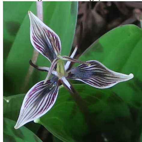
Scoliopus bigelovii , fetid adder's tongue

Ann's cell phone: 707-721-6120 (likely doesn't work at Armstrong Woods, though)