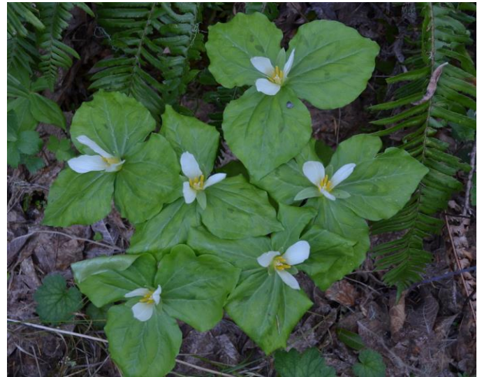
Trillium albidum – Green Valley Road

After finding the second, more cryptic, patch of leatherwood, we visited an emerging population of a robust perennial Phacelia , most likely P. nemoralis , not a "rare" plant, but rather uncommon in Sonoma County. We agreed a return visit in later spring was now necessary to see the bristly foliage grace itself with some flowers (albeit, not very showy ones).